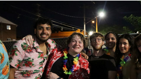
Our third annual Beach Bash brought students together for fun, friendship, and a warm welcome to campus.