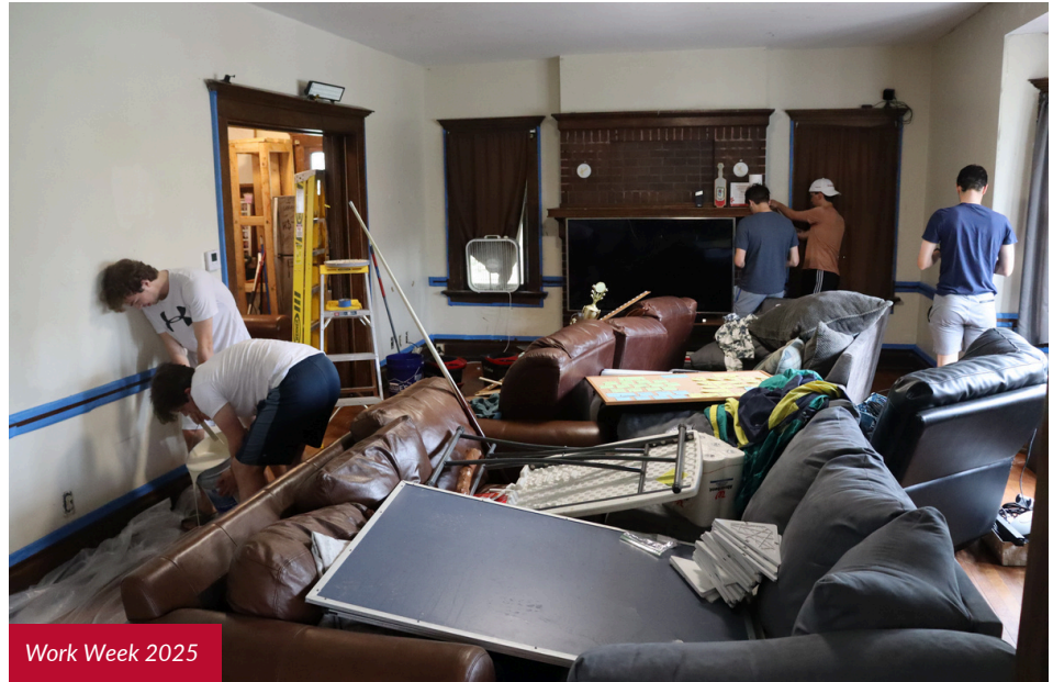
Work Week 2025